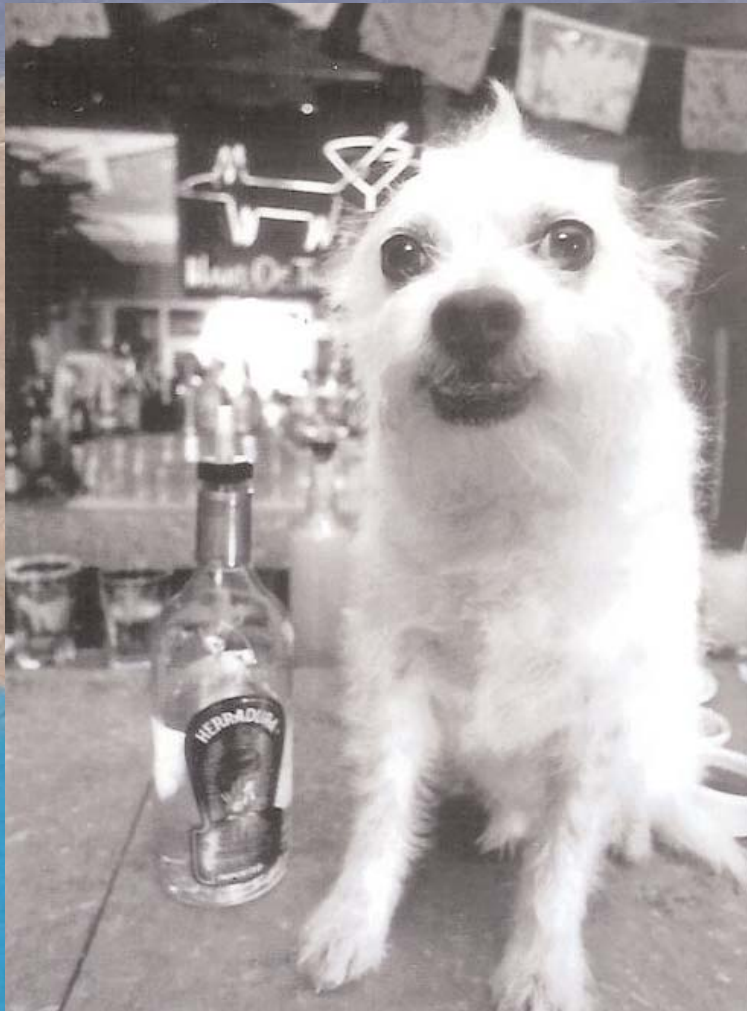
MERCEDES Hair of the Dog Cantina